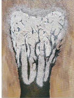
2020 Cabernet Franc San Benito County / Small Lot Production