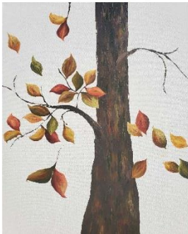
2020 Tannat / Small Lot Production Adelaida District, Paso Robles