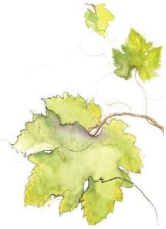
2014 Grenache Santa Clara County / Small Lot Production