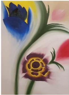
2020 Petite Sirah San Benito County / Small Lot Production