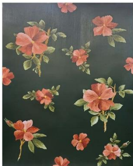
2020 Sagacious One San Benito County / Small Lot Production