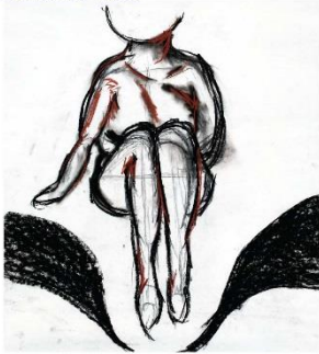
2020 Cabernet Sauvignon Clone 8 - Old Vines Paso Robles / Small Lot Production