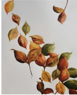
Cabernet Sauvignon Paso Robles / Small Lot Production