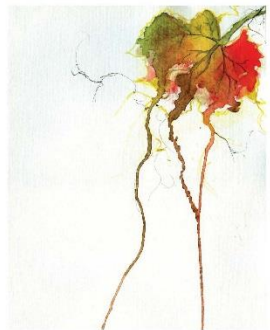
2016 Johannisberg Riesling Santa Clara County / Small Lot Production